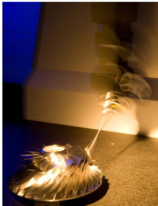
Unique laser correction allows Renscan5 to measure parts at ultra-high-speeds and acc/dec

Renscan5 allows the CMM's three-axis platform to be used primarily to "rapid" the REVO head into position for measurement. Where CMM motion is required for a measurement routine, it can usually be limited to a single linear axis and performed at constant velocity, minimizing dynamic effects on accuracy from acc/dec and inertia.